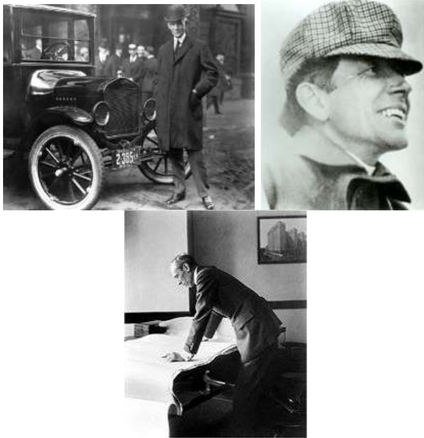
Figure 2. Three Auto Archetypes: Ford, the Innovator; Durant the Promoter; Sloan the Manager

Source: Henry Ford: Henry Ford Museum, Dearborn, Mich.; William Durant, c. 1908: National Automobile History Collection, Detroit Public Library; Alfred P. Sloan, c. 1923: GM Heritage Center.