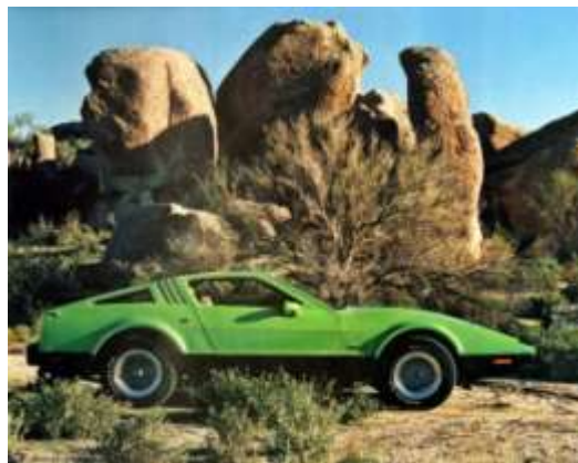
Figure 1: A Bricklin Promotional Image, 1973