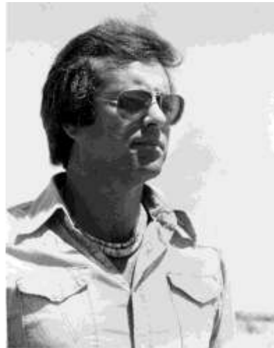
Figure 3. Malcolm Bricklin: The Rugged Individualist