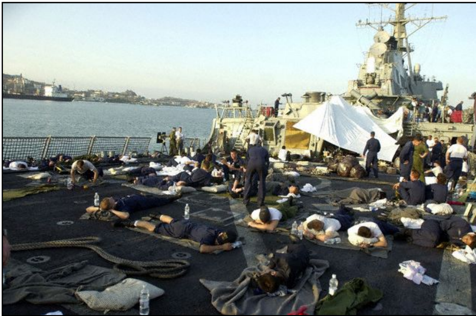
Figure 4 Fire in the Post-Asbestos Era: The U.S.S. Cole , 2000

Asbestos-free electrical insulation on the U.S.S. Cole burned for 96 hours.